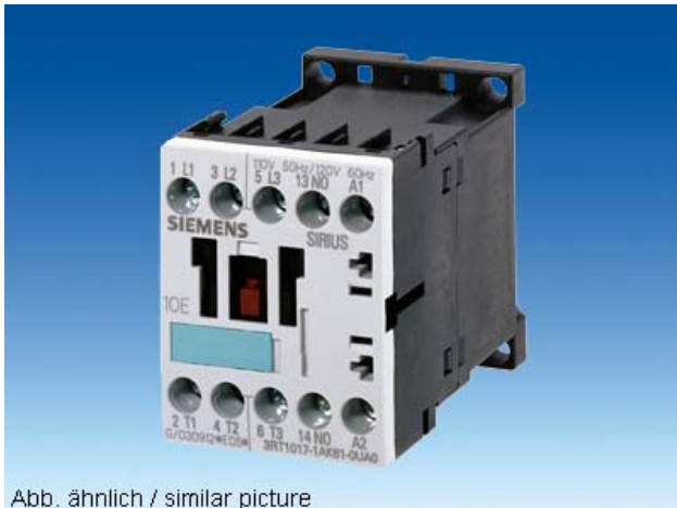
Abb. ähnlich / similar picture

CONTACTOR, AC-3 3 KW/400 V, 1 NO, DC 110 V, 3-POLE, SIZE S00, SCREW CONNECTION