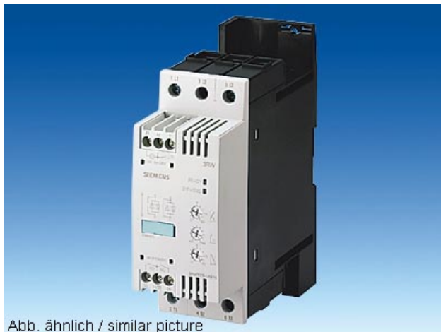
Abb. ähnlich / similar picture

SIRIUS CUSHIONED STARTER, SIZE S0, 12,5A, 5.5 KW / 400 V, AC 200...460 V, UC 110...230 V, SCREW CONNECTION