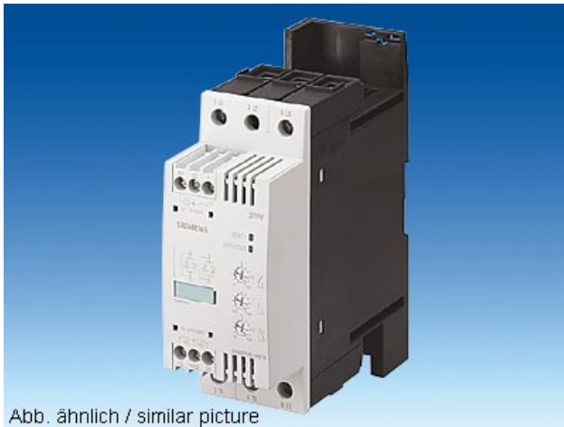
Abb. ähnlich / similar picture

SIRIUS CUSHIONED STARTER, SIZE S2, 45 A, 22 KW / 400 V, AC 200...460 V, UC 110...230 V, SCREW CONNECTION