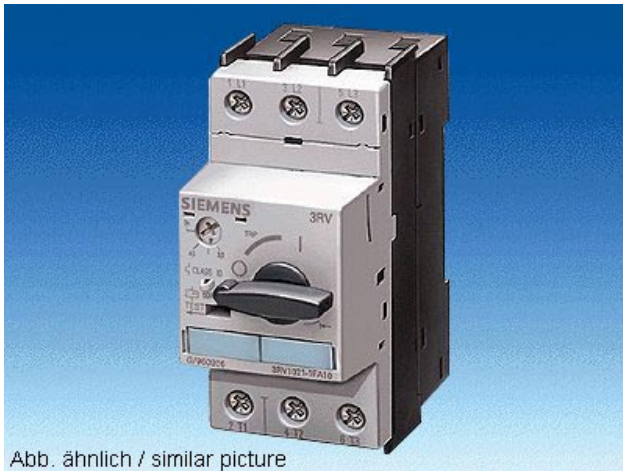
Abb. ähnlich / similar picture

CIRCUIT-BREAKER SIZE S0, FOR MOTOR PROTECTION, CLASS 10, A-REL. 5.5...8A, N-REL. 104A, SCREW TERMINAL, STANDARD SWITCHING CAPACITY