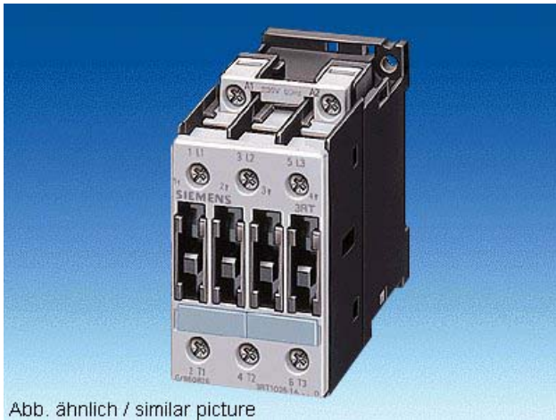
Abb. ähnlich / similar picture

CONTACTOR, AC-3 7.5 KW/400 V, DC 110 V, 3-POLE, SIZE S0, SCREW CONNECTION, MOUNTING POSITION VERTICAL