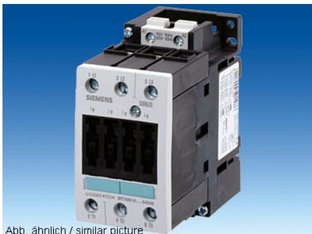
Abb. ähnlich / similar picture

CONTACTOR, AC-3 15 KW/400 V, AC 110 V, 50 HZ, 3-POLE, SIZE S2, SCREW CONNECTION