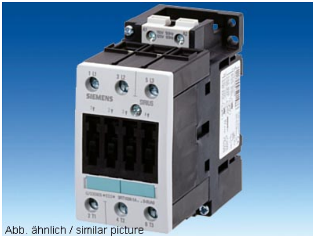
Abb. ähnlich / similar picture

CONTACTOR, AC-3 18.5 KW/400 V, DC 110 V, 3-POLE, SIZE S2, SCREW CONNECTION