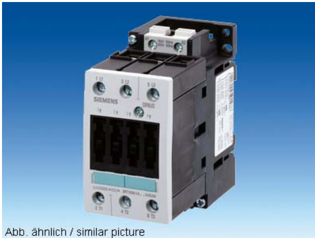
Abb. ähnlich / similar picture

CONTACTOR, AC-3 22 KW/400 V, AC 110 V, 50 HZ, 3-POLE, SIZE S2, SCREW CONNECTION MOUNTING POSITION VERTICAL