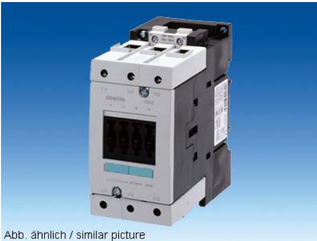
Abb. ähnlich / similar picture

CONTACTOR, AC-3 30 KW/400 V, AC 110 V, 50 HZ, 3-POLE, SIZE S3, SCREW CONNECTION MOUNTING POSITION VERTICAL