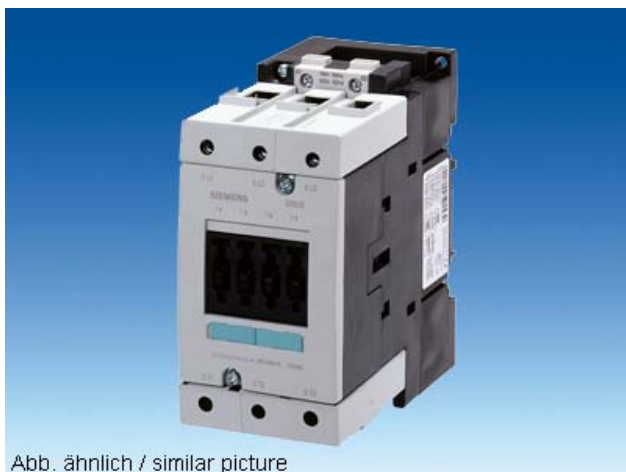
Abb. ähnlich / similar picture

CONTACTOR, AC-3 45 KW/400 V, AC 24 V, 50 HZ, 3-POLE, SIZE S3, SCREW CONNECTION MOUNTING POSITION VERTICAL